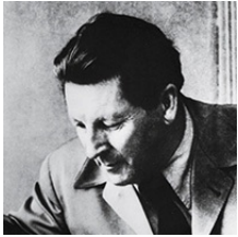
Gerrit Thomas Rietveld

Gerrit Thomas Rietveld, born in Utrecht on 24 June 1888, seems possessed of two personalities, each so distinct that one might take his work to be that of more than one artist. The first personality is that seen in the craftsman cabinet-maker working in a primordial idiom, re-inventing chairs and other furniture as if no one had ever built them before him and following a structural code all of his own; the second is that of the architect working with elegant formulas, determined to drive home the rationalist and neoplastic message in the context of European architecture. The two activities alternate, overlap, and fuse in a perfect osmosis unfolding then into a logical sequence. In 1918 Rietveld joined the "De Stijl" movement which had sprung up around the review of that name founded the year before by Theo van Doesburg. The group assimilated and translated into ideology certain laws on the dynamic breakdown of compositions (carrying them to an extreme) that had already been expressed in painting by the cubists: the "De Stijl" artists also carefully studied the architectonic lesson taught by the great Frank Lloyd Wright, whose influence was widely felt in Europe at that time.