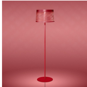
Twiggy Grid Lettura