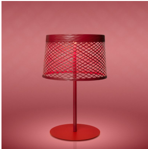
Twiggy Grid XL