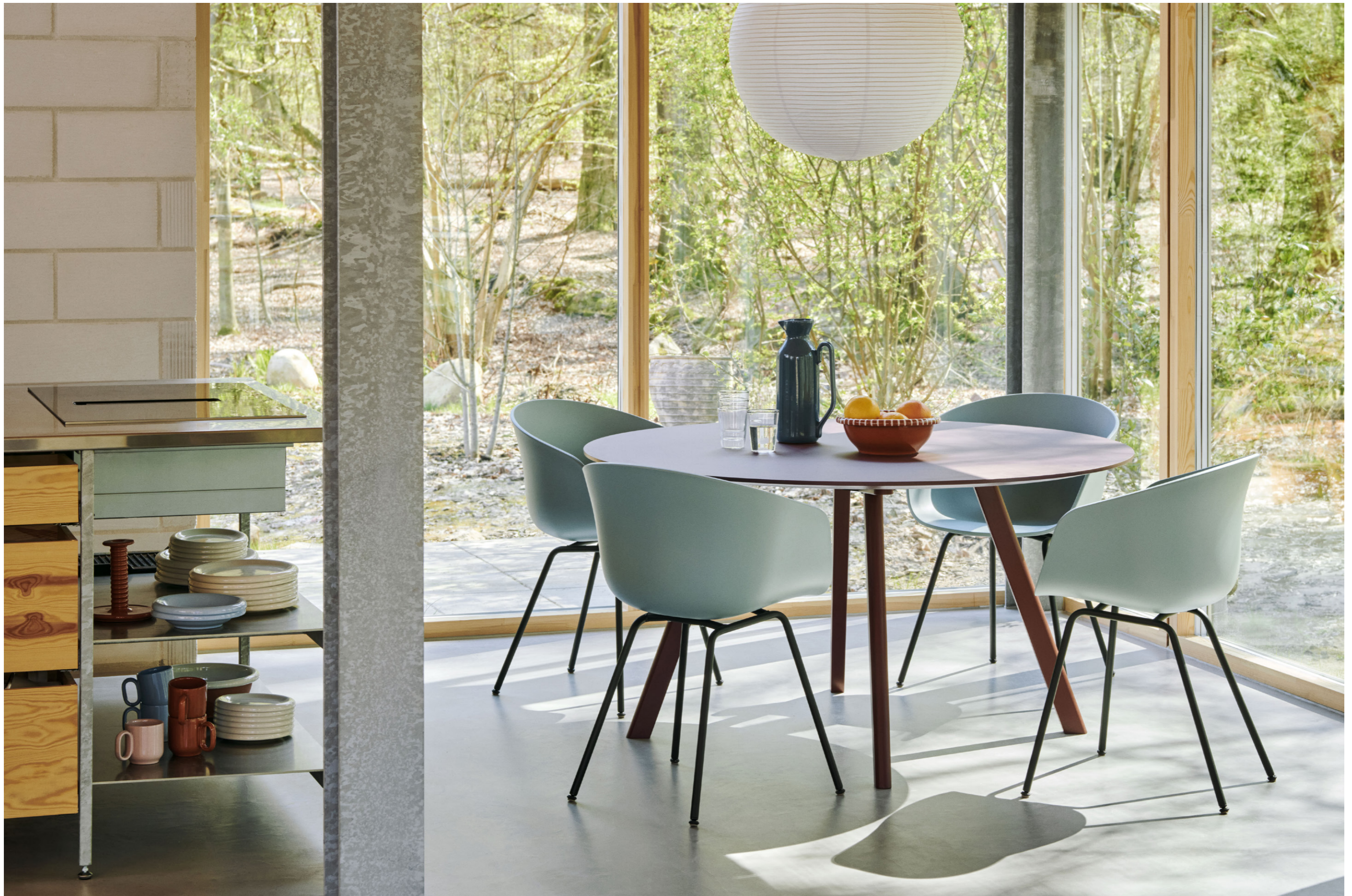
CPH 25 Table Ø140 | Burgundy linoluem tabletop | Bordeaux oak frame