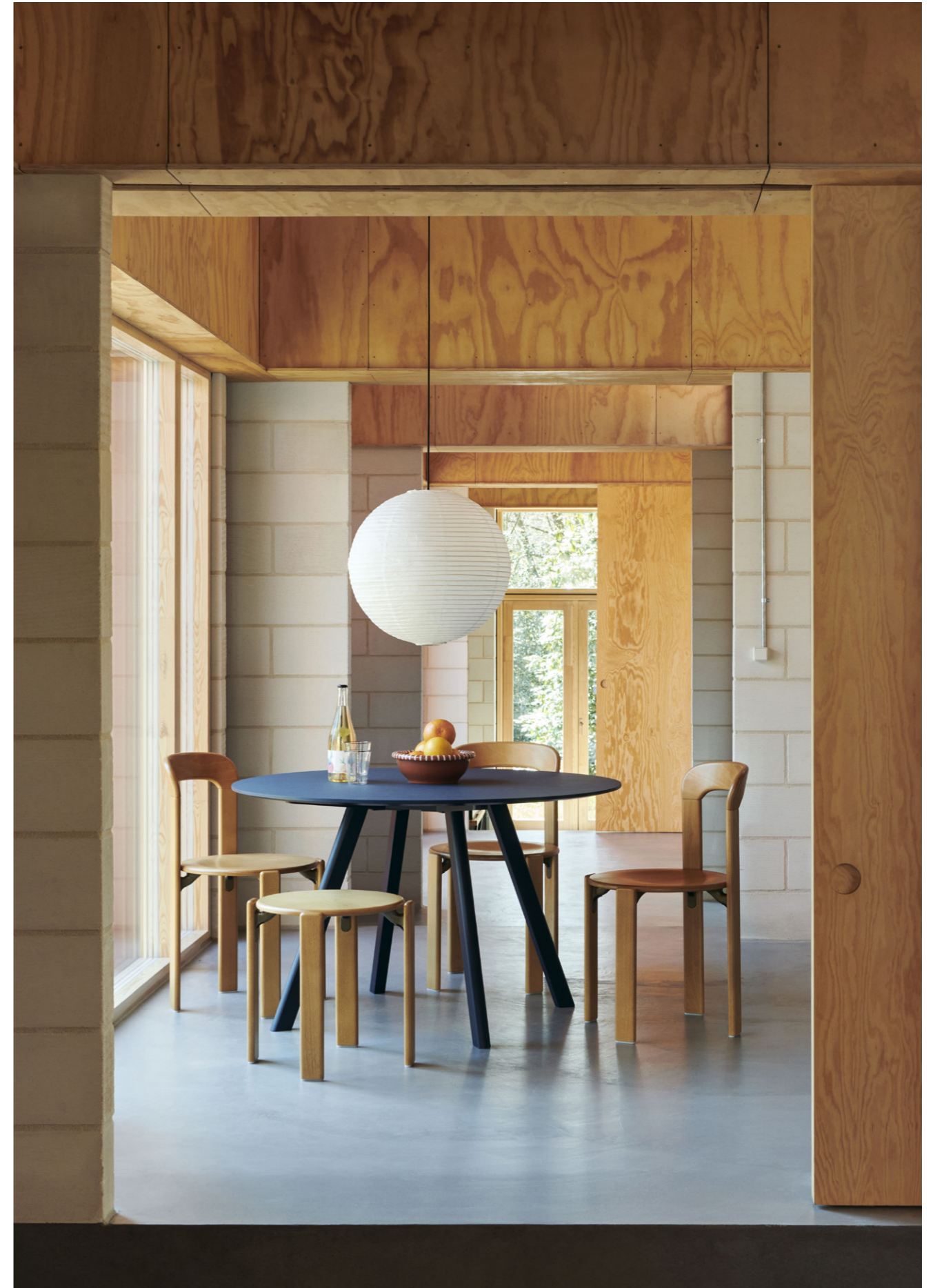
CPH 25 Table Ø120 | Smokey blue linoleum tabletop | Deep blue oak frame

Sharing the same characteristic angled legs as the rest of the Bouroullec brothers' Copenhagen range, the CPH25 table features a round tabletop that softens the engineered expression. The four-legged table frames and tabletops are available in a variety of wood types, materials, and colours, with the possibility to select matching or contrasting combinations. Equally suitable for intimate meetings and larger, café-like environments, this versatile table has an ability to blend into private homes as well as public spaces.