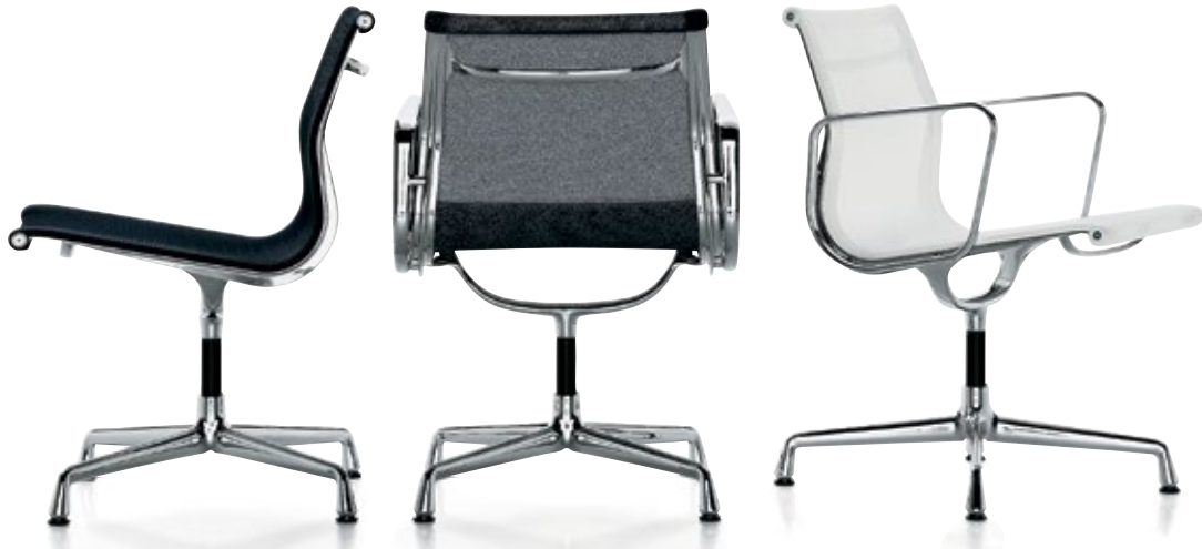
EA 105, EA 108, EA 107

The chairs in the Aluminium Group are the best known design by Charles and Ray Eames. The chairs were created in 1958 and are now a classic in the history of 20th century design.