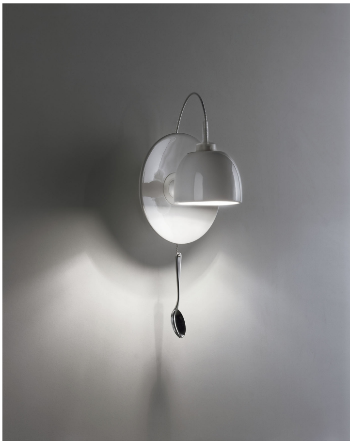
Light Au Lait FABIEN DUMAS, INGO MAURER UND TEAM 2004

Products in the "Essentials" category are usually available for immediate delivery. Stone ware, silicone, stainless steel. The cup swivels through 180° and can be bent down up to 30° by means of a ball joint. Integrated pull switch with spoon.